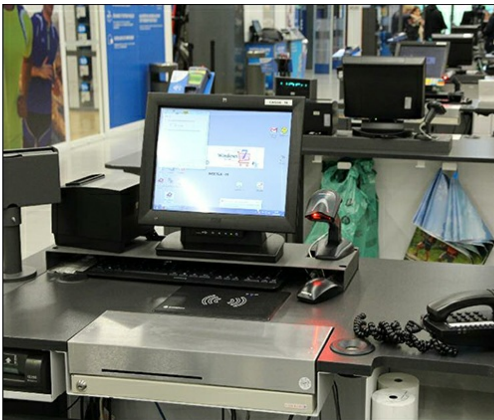
EmbiPos, a stationary reader at PoS locations, tracks purchases.

Decathlon also had to certify the 25,000 readers used in factories, warehouses and stores in 25 countries. Embisphere was in charge of ensuring that happened, Lieby says.