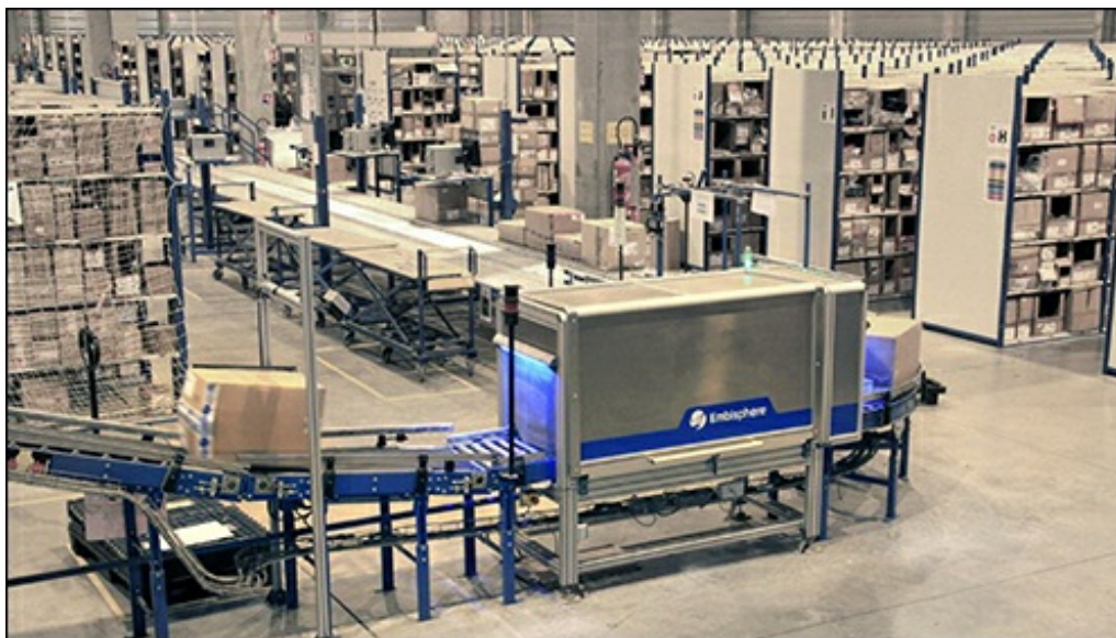
EmbiWay, a fixed UHF RFID tunnel reader deployed on conveyor belts at suppliers' factories, monitors boxes as they are shipped out to Decathlon warehouses.

The end goal was to improve customer satisfaction by ensuring items were on store shelves when customers wanted to buy them. That meant increasing inventory visibility of a wide range of merchandise. Decathlon sells roughly 35,000 different items—apparel, equipment and accessories for 65 sports, for men, women and children—usually in superstores.