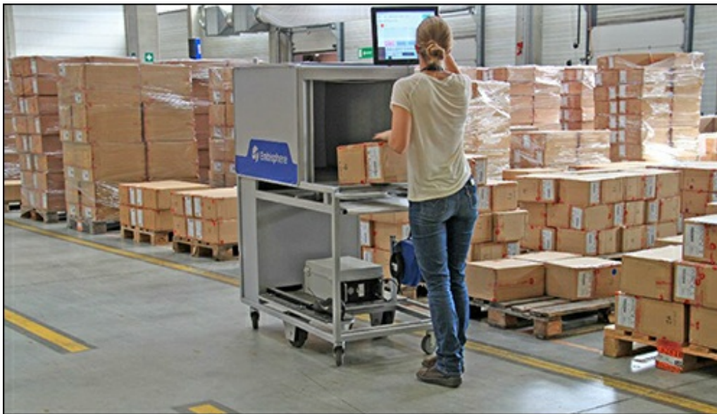
When boxes of products arrive at Decathlon's warehouses, embiTrolley, a mobile tunnel reader, is used for quality, inventory and shipment control.